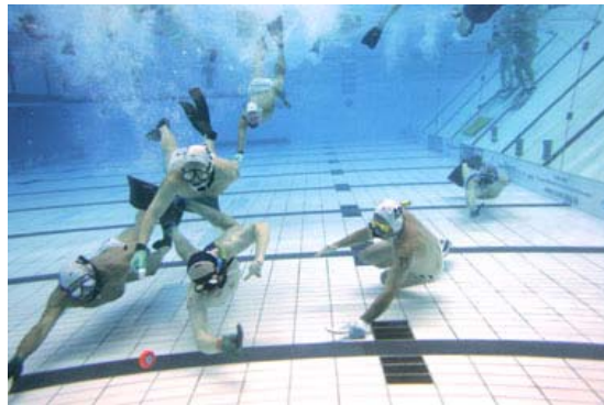
Gr.Britain VS Australia—Elite Women 2006

⇒ Best Wishes & Good Luck from EUHC to all Canadian U/W Hockey Players who committed to & made the Canadian teams for travel to the upcoming 2008 World Championships in Durban, South Africa.